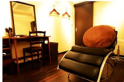
Daikanyama salon in Tokyo