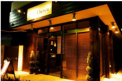
Komazawa salon in Tokyo